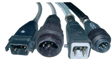
cordset for all brands